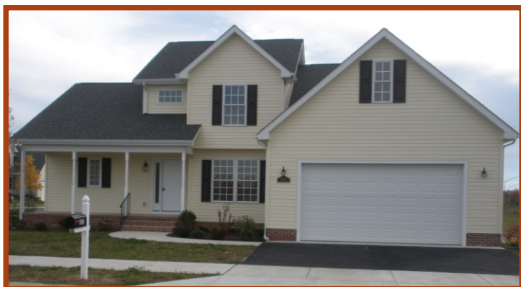
203 Reeand Lane Church Hill, MD

The Brook Valley model is finished and ready for you to move in! This 4 bedroom, 2.5 bath home is great for all walks of life. The master suite is on the first level and there are 3 bedrooms upstairs along with a finished bonus room that could possibly be bedroom number 5. The kitchen, breakfast nook and great room are all open to give an openness feel through out. There is a separate dining room, laundry room, 2-car garage, plenty of closet space, all appliances, granite counter tops and so much more in this builder model. Call today to tour The Brook Valley!