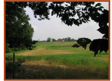
View from the walking trail at The Preserve at Southeast Creek.

30th at The Preserve at Southeast Creek. Come out and enjoy local wines and tour our community, vineyard and under construction model home. Also at The Preserve at Southeast Creek we are proud to announce our attempts for a Nature Friendly community. Currently we are having bird houses constructed on the walking trails of The Preserve at Southeast Creek. Stay tuned for more information and a completion date to come bird